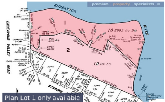
Plan Lot 1 only available