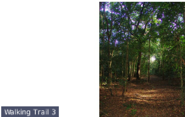
Walking Trail 3