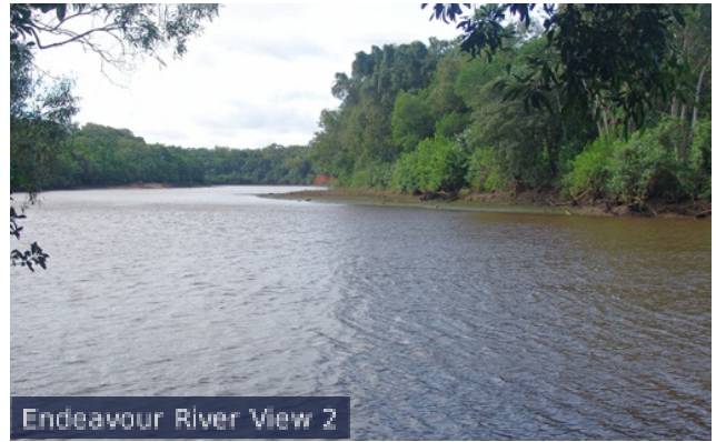
Endeavour River View 2